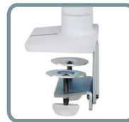
INCLUDED: STANDARD 2-PIECE DESK CLAMP ATTACHES TO SURFACE EDGE