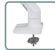
INCLUDED: GROMMET MOUNT ATTACHES THROUGH SURFACE HOLES