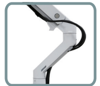
CABLES ROUTE BENEATH THE ARM, OUT OF THE WAY